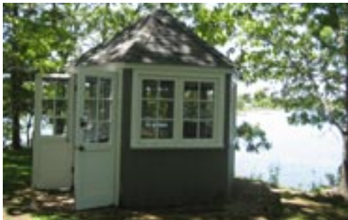
The now-famous writing studio that Steinbeck built on his property, facing the water. Steinbeck wrote two of his books while living in Sag Harbor-- "The Winter of Our Discontent" (1961) and "Travels with Charley" (1962), and won the Nobel Prize for Literature in 1962.