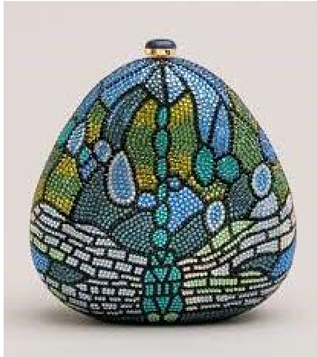
A Judith Leiber purse from the Leiber Collection.

The Springs tour may also possibly include a refreshment stop at the Maidstone Park Beach picnic shelter and a chance to meet a representative group of Springs artists, sculptors, writers and filmmakers. Information on cost, RSVPs, a tour schedule and map will be forthcoming.