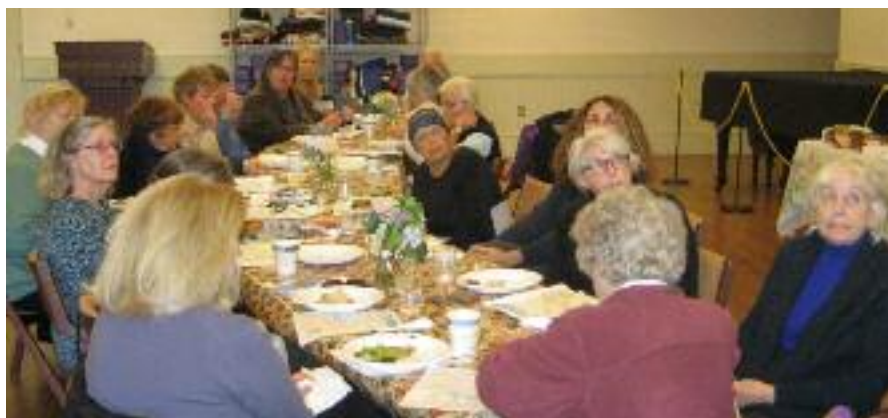
On January 31, approximately 20 LWWH members attended the annual Program Planning meeting at Southampton's Rogers Memorial Library.