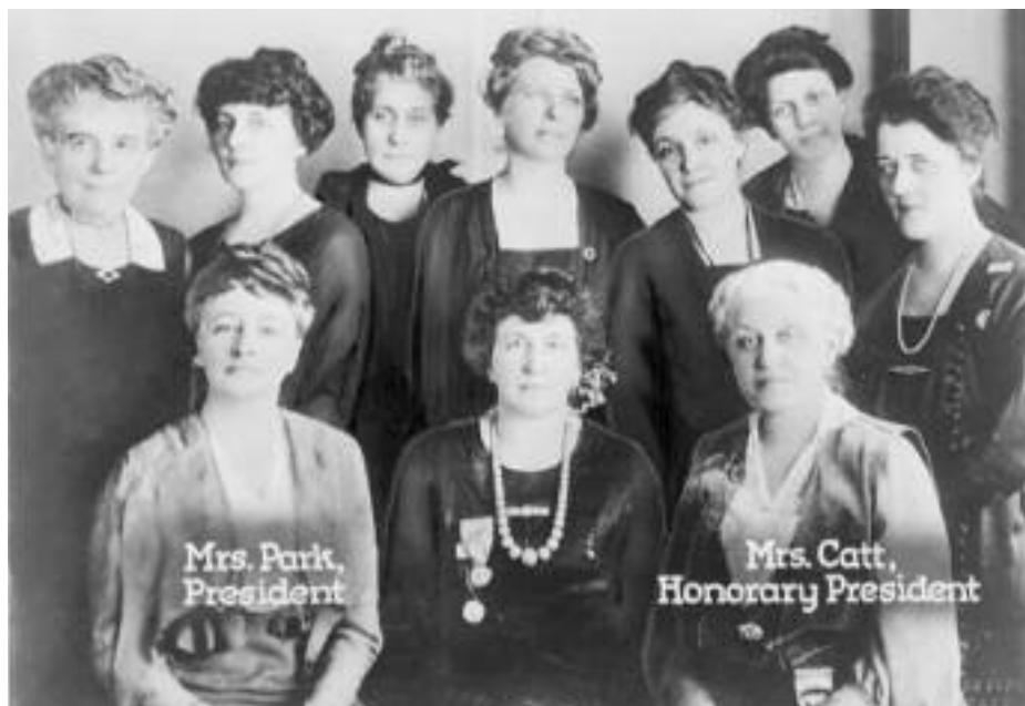
The photo, taken in 1920, of the first Board of the National League of Women Voters

The National League of Women Voters was founded by Carrie Chapman Catt on February 14, 1920 during the convention of the National American Woman Suffrage Association, which took place in Chicago. The convention was held just six months before the 19th amendment to the U.S. Constitution was ratified in August, giving women the right to vote nationwide after a 72-year struggle. Maud Wood Park was elected the first president of the League.