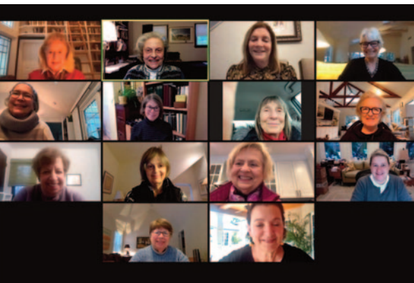
A virtual welcome to new members

Please cut here and mail our membership form in an envelope to: LWVH/SI/NF P.O. BOX 2253, EAST HAMPTON, NY 11937