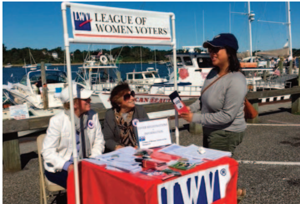
Registering voters all year round

If you like to meet new people and greet friends, join the Membership Committee, which provides a presence at general meetings, debates and community and special events. This committee is also responsible for recruiting new members, and spreading the word about what the League stands for. Our Ambassador program shares information on the League, its committees and activities, and community events through public libraries and other venues. Events are organized throughout the year, open to all. Many who attend decide to join the League because of the people they meet.