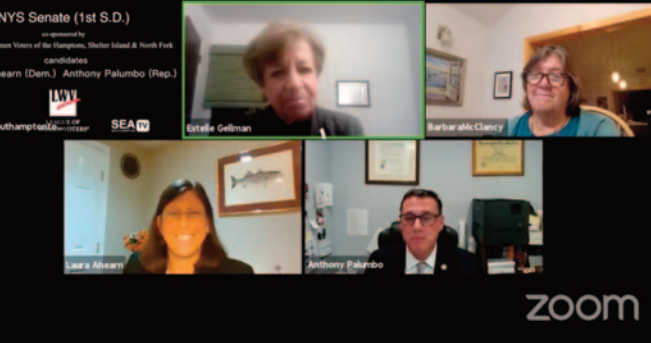
Zoom replaced live debates, but LWV still conducted them