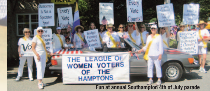
Fun at annual Southampton 4th of July parade

Democracy is not a spectator sport! Get involved!