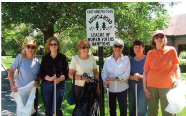
Sharing in community activities