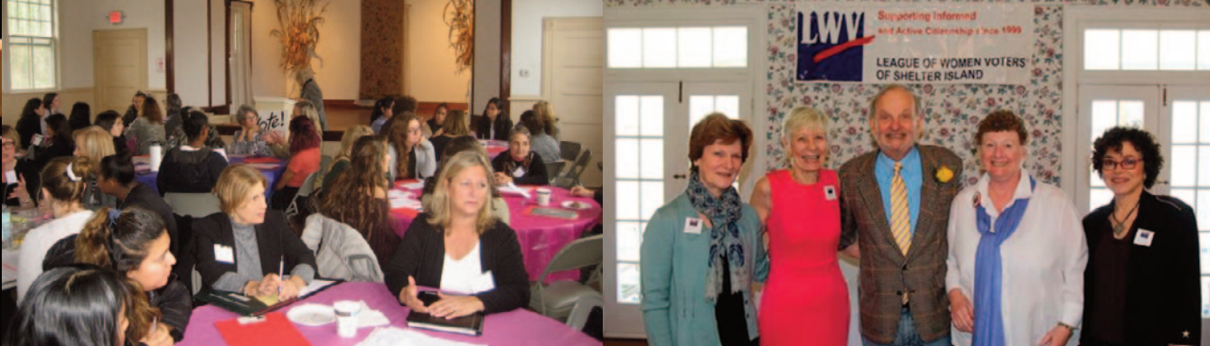
Running & Winning